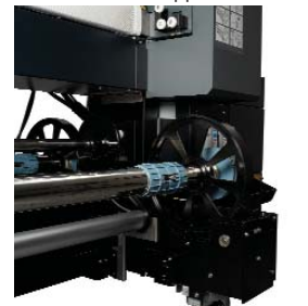
HP Super heavy duty take-up reel