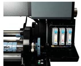
1000 ml HP Ink Supplies