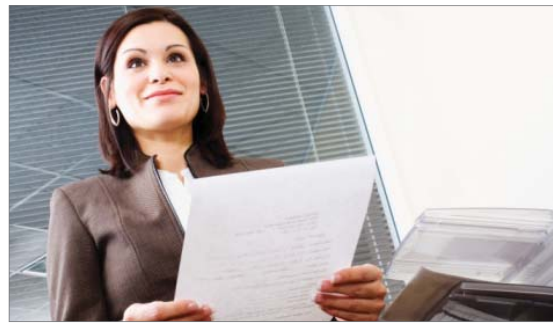
Redirect print jobs from desktop printers to MFPs with a lower cost-per-page.